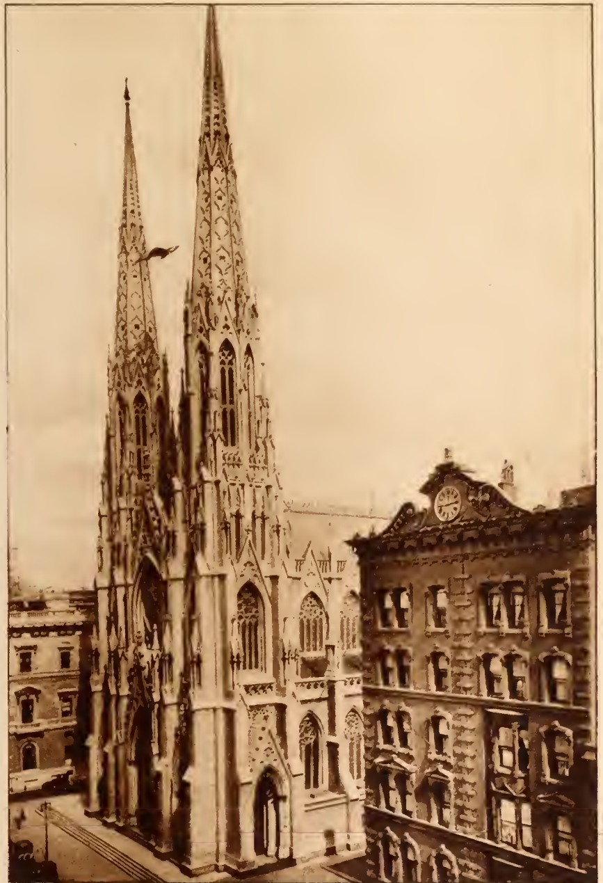
ST. PATRICK'S CATHEDRAL, at 5th Avenue and 50th Street. Finest Roman Catholic Church in the United States. Seating capacity 2500. Cost $3,000,000.